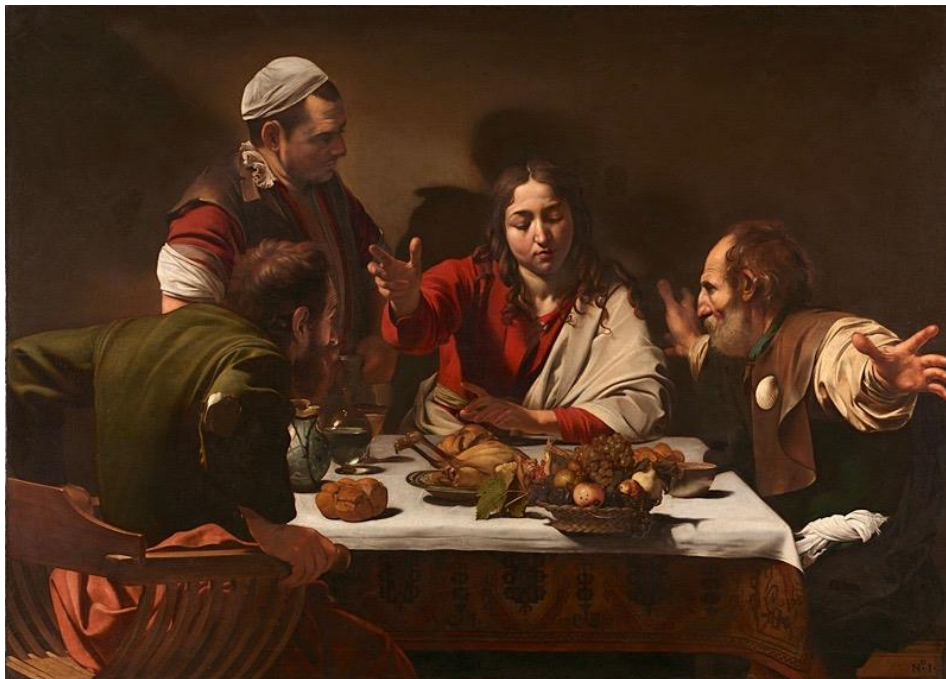
The Supper at Emmaus [1601]. Caravaggio [1571-1610]

This evening's readings take us beyond this morning's excitement at the discovery of the empty tomb. The Old Testament lesson concerns another dimension of resurrection.